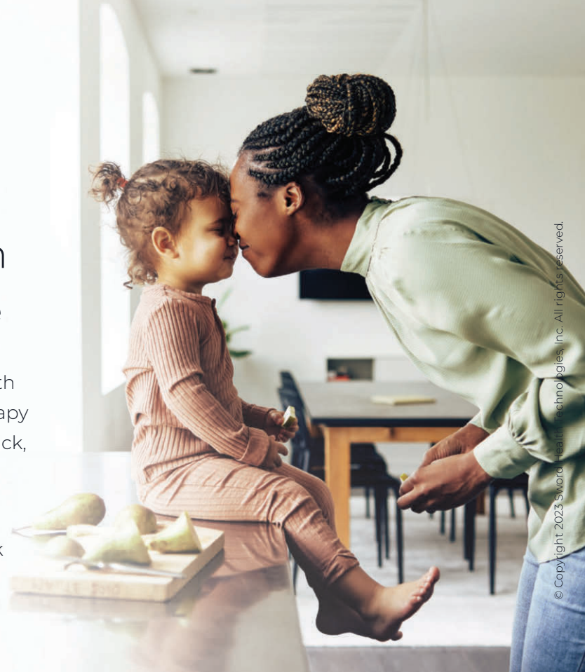
© Copyright 2023 Sword Health Technologies, Inc. All rights reserved.

Combining licensed PT with easy-to-use technology, Sword is more than just convenient. It's proven to work better than in-person physical therapy, too. 1