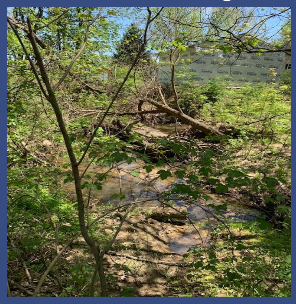
Looking East: End of Driftwood Drive